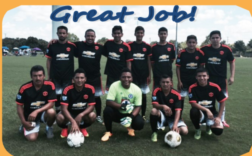
MCFCU is the Proud Sponsor of the Manatee Soccer League – Champions Community Team: Deportivo Tecozautla!

The first 3 days of every month we have featured cars from our preferred dealers on our Everything Auto site (CU Behind the Wheel). If you purchase a featured vehicle during the 3 day virtual sale and finance with MCFCU you may qualify for a $100 gas card. Sign up for our Eblasts to get reminders each month!